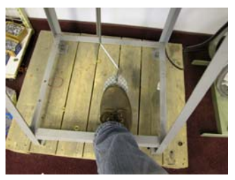
8. Step on the paddle to engage the clutch.