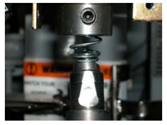
5. Replace the top die. Note the notch should face the set screw and the spring should be riding on the