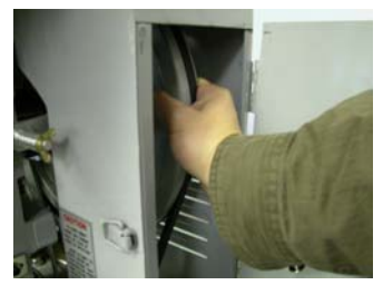
9. Open the side door and turn the flywheel clockwise.