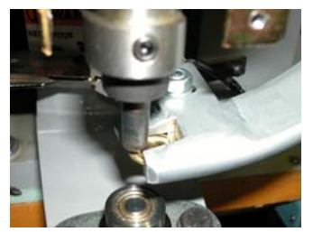
17. Turn the flywheel clockwise. The track should return without contacting the die.