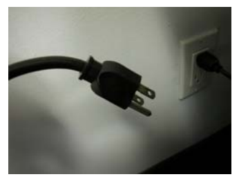
1. Unplug the machine before performing any adjustment or maintenance.