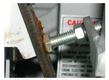
13. If the track is pushed away too early, the grommet may fall from the pin. Adjust this bolt for right timing.