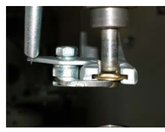
7. Check if the pin of the top die is in the middle of the opening at the end of the track.