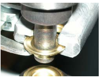
10. The shaft start to move down and the pin of the top die will go through the hole of the grommet.