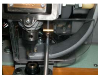
2. Remove the transparent safety guard and small table (if equipped).